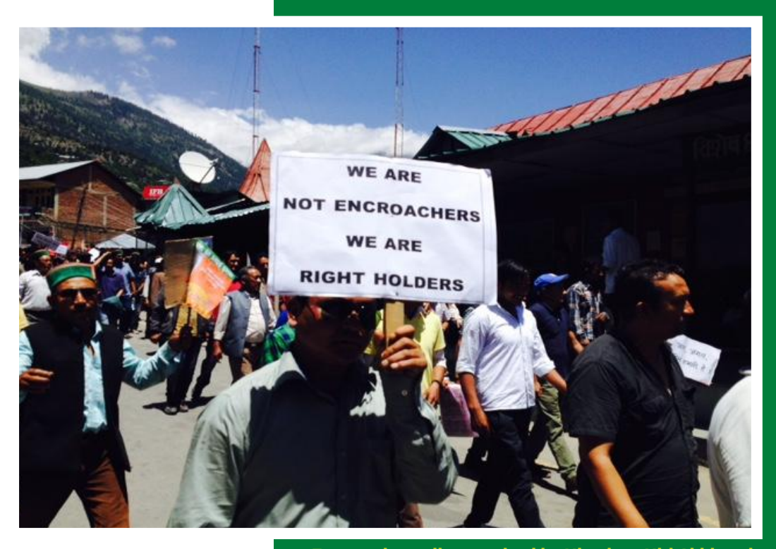
Farmers in a rally organised by Himalaya Niti Abhiyan in Rekongpeo, Himachal Pradesh

The Karnataka State forest department, acting on the decision of the state government to identify and remove any 'encroachment' on forest land, identified forest land under encroachment and has filed an affidavit before the High Court (HC) to take a decision on these cases<sup>40</sup>. The forest department has submitted a time-line to the HC, giving details on the method of removing the encroachment and the time required for each case. The HC has allowed for all encroachments above 3 acres to be removed in the first phase following which 42 such cases of encroachment over 750 acres in Dakshina Kannada, Udupi and parts of Chikkamagaluru and Shivamogga districts have already been removed. While the forest department has said that people who are have claimed land under the FRA will not be removed, it is not clear from the news report if the process of filing claims under the FRA has been initiated in these districts.