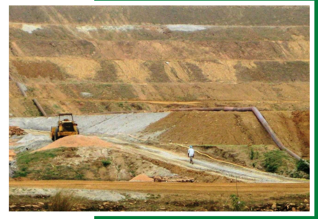
Open Cast mine in Angul, Odisha; Photo: Meenal Tatpati

On the 24th February 2015, MoTA has issued a circular stating that for forest clearance in cases involving diversion of forest land for strategic defense project in the north eastern states, a certificate from the District Collector, certifying that, 'no further procedure with regard to the FRA is required', can be given as documentary evidence for FRA compliance; since most forest land in north eastern states is already under the control and ownership of communities and in areas declared as Reserved Forests, and rights have already been settled.