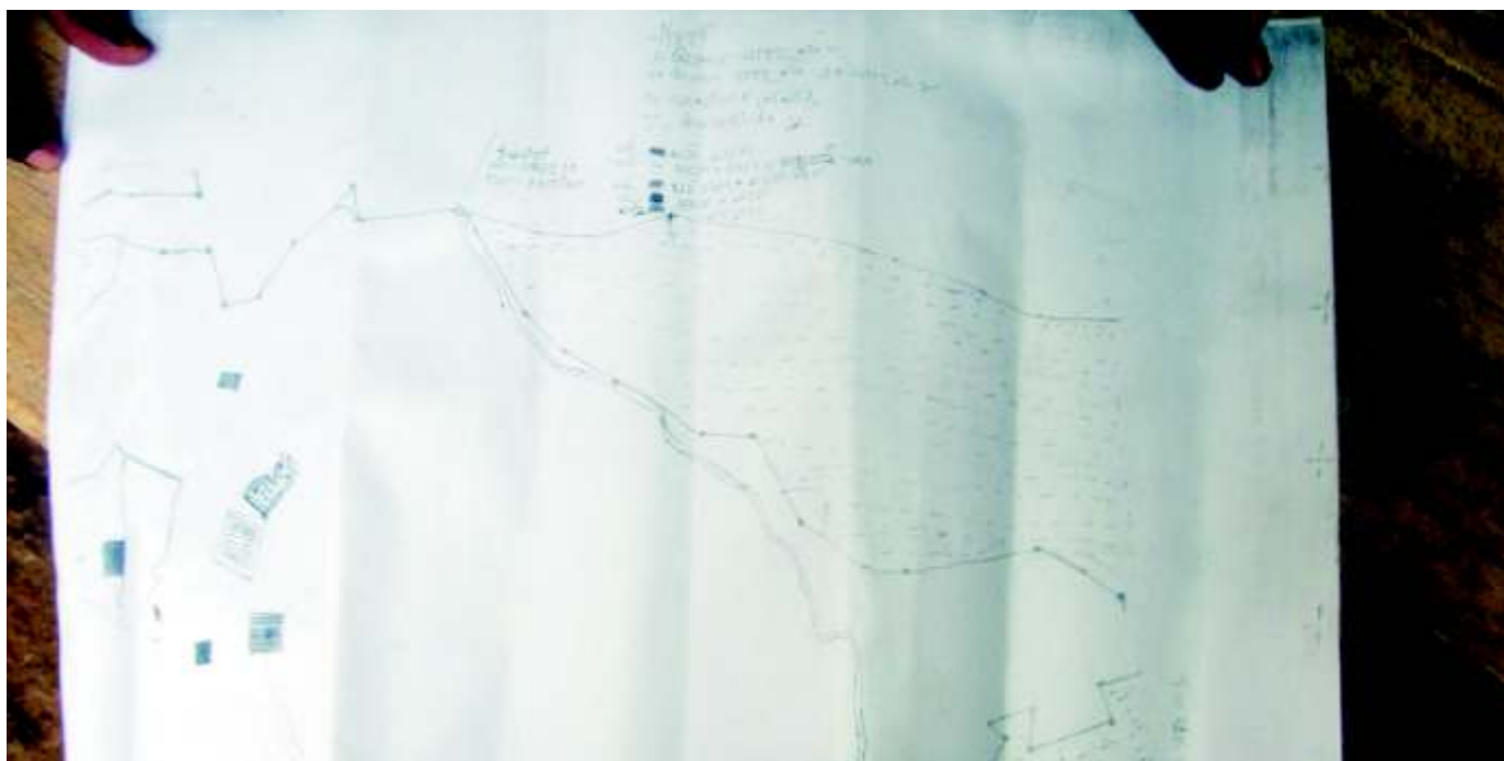
Figure 12 One of the 7 sheets of map of community forest resource of Chaingada village, Ranchi which has claimed CFRs but recognition is pending (Ambika Tenneti)