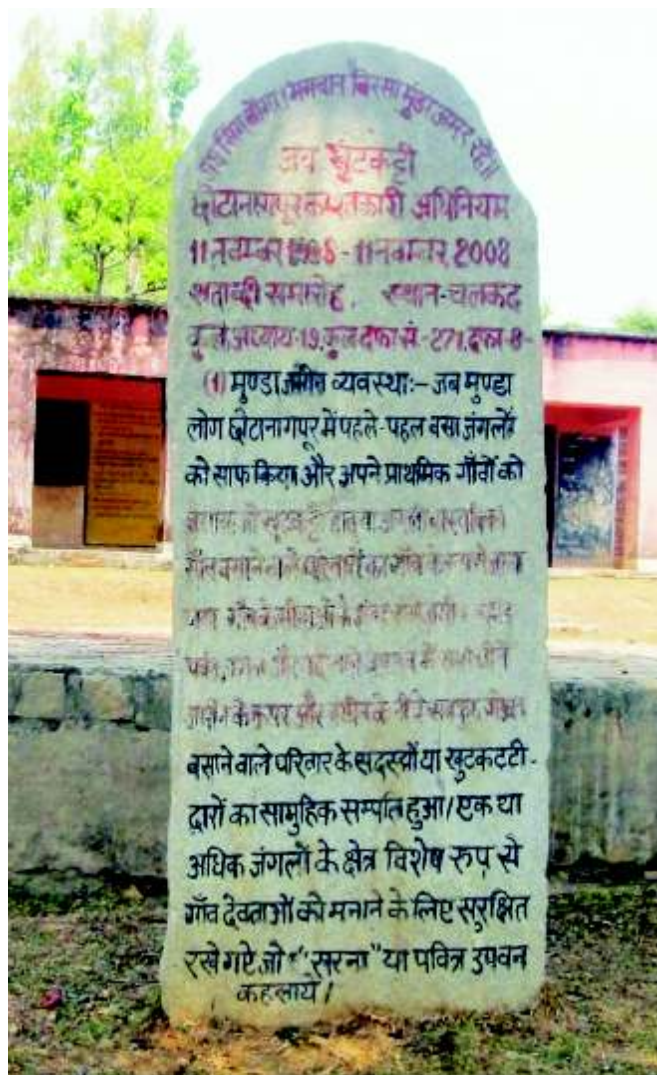
Figure 2 A stone engraved with the special provisions for the Mundari Khuntkatti Villages under the CNTA 1908. Recognition of rights under this act has led to reluctance in many villages of the Khunti district of Jharkhand to claim CFRs. (Ambika Tenneti)

landscapes have also occasionally driven forest tenure reforms to accommodate forest-people relations. The category of village forests in Indian Forest Act, the provisions of community forest