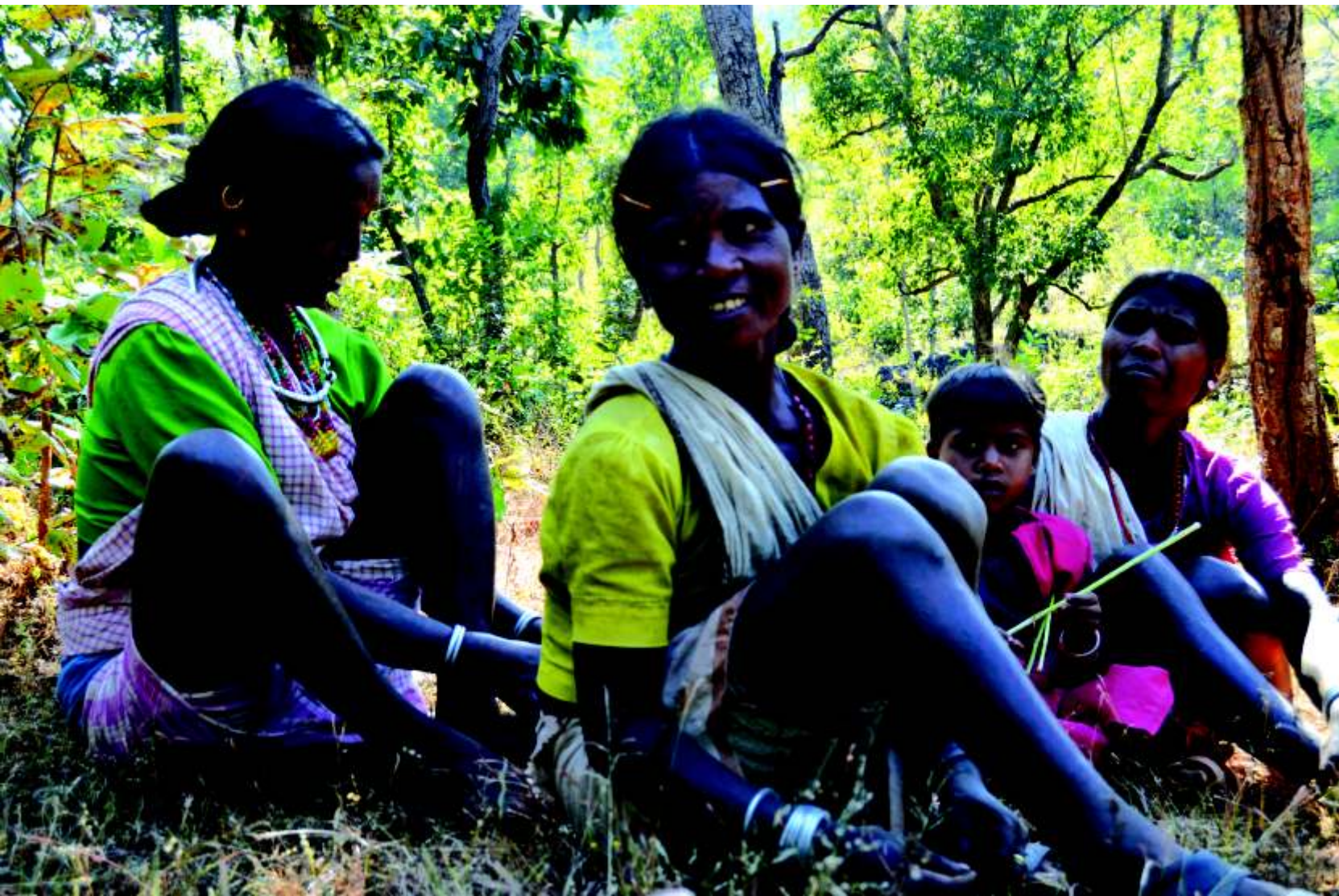
Figure3 Baiga women of village Pondi (in Dindori district, Madhya Pradesh) which has received recognition of community forest rights (Ashish Kothari)

This section provides an overview of the recent developments, at both policy and implementation level, relevant to the provision of CFRs. For information, it depends upon a study of circulars, guidelines, reports and discussions that have taken place during the two National Consultations (in 2012 and 2013) on CFRs organised by CFR-LA. It also broadly represents some of the situations studied for the detailed case studies (provided as annexures to this report). Please note that the section does not cover the full range of situations all over India, and is based on limited information.