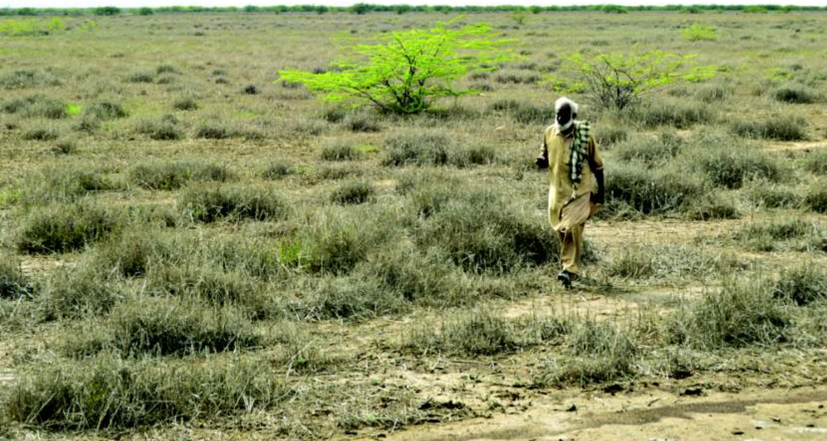
Figure 5 The banni grasslands of Kachchh where Maldharis are trying to have their grazing rights recognized (Ashish Kothari)