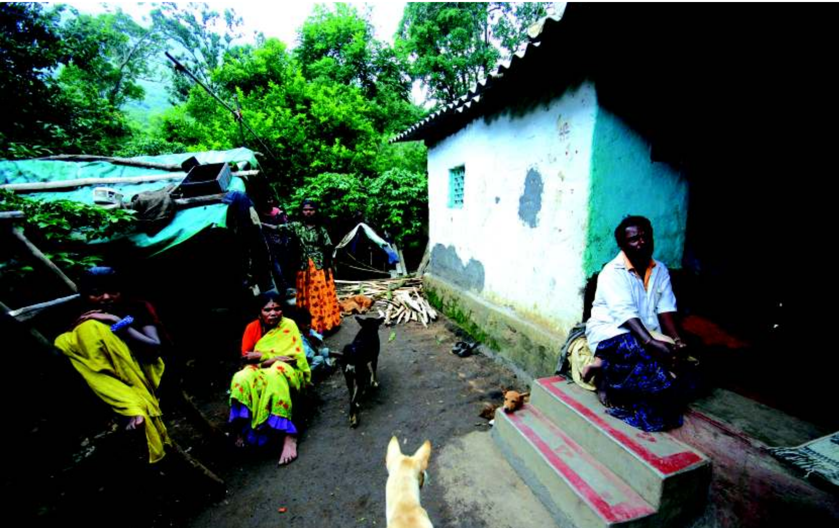
Figure 10 Soligas in a village of BRT Wildlife Sanctuary, Karnataka (Ashish Kothari)

The six Soliga clans in BRT have, over generations, demarcated clan-specific forest areas that they call yelle or jaaga . Each yelle contains 6 types of sacred sites such as burial sites, stone shrines, god and goddess sites. There are 46 yelles in BRT and 489 sacred sites, all of which have been mapped by Soligas with the support of Ashoka Trust for Research in Ecology and the Environment (ATREE). The composite map that was produced as a result of this effort was used as evidence by Gram Sabhas for claiming CFR rights. Sacred sites are visited by Soligas 2-5 times a year. However the notification of the wildlife sanctuary in 1974 and the displacement of Soligas over the last few decades has resulted in significant hardships to the Soligas in accessing these sites.