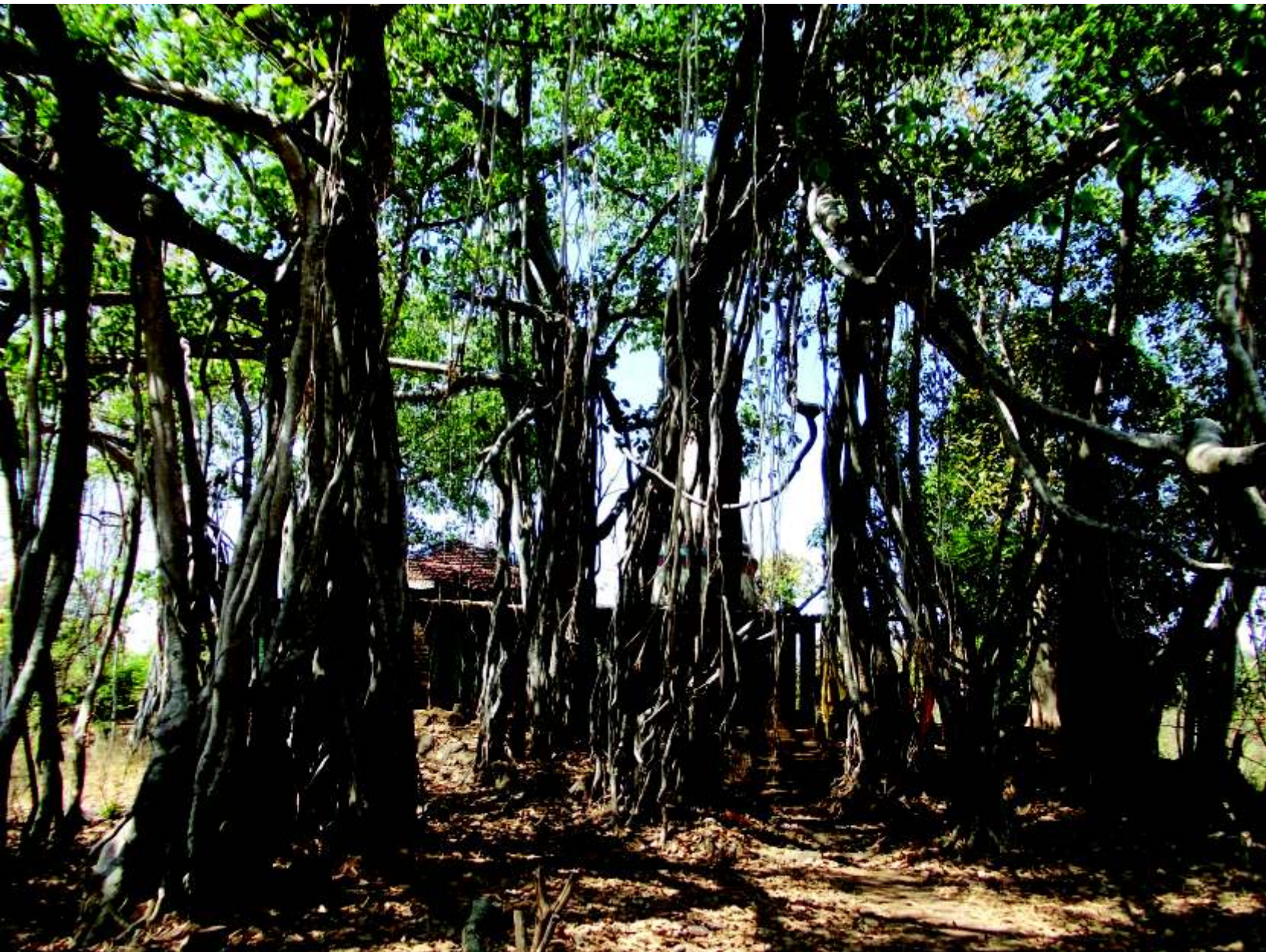
Figure 7 The ancient Hatkeshwar temple in Chasole Village, Thane district of Maharashtra, which lies within the submergence zone of Kalu drinking water project

region in Dindori district of Madhya Pradesh and Rajasthan while an update on the CFR situation is provided for the three case studies of Maharashtra, Odisha and BRT Wildlife Sanctuary of Karnataka.