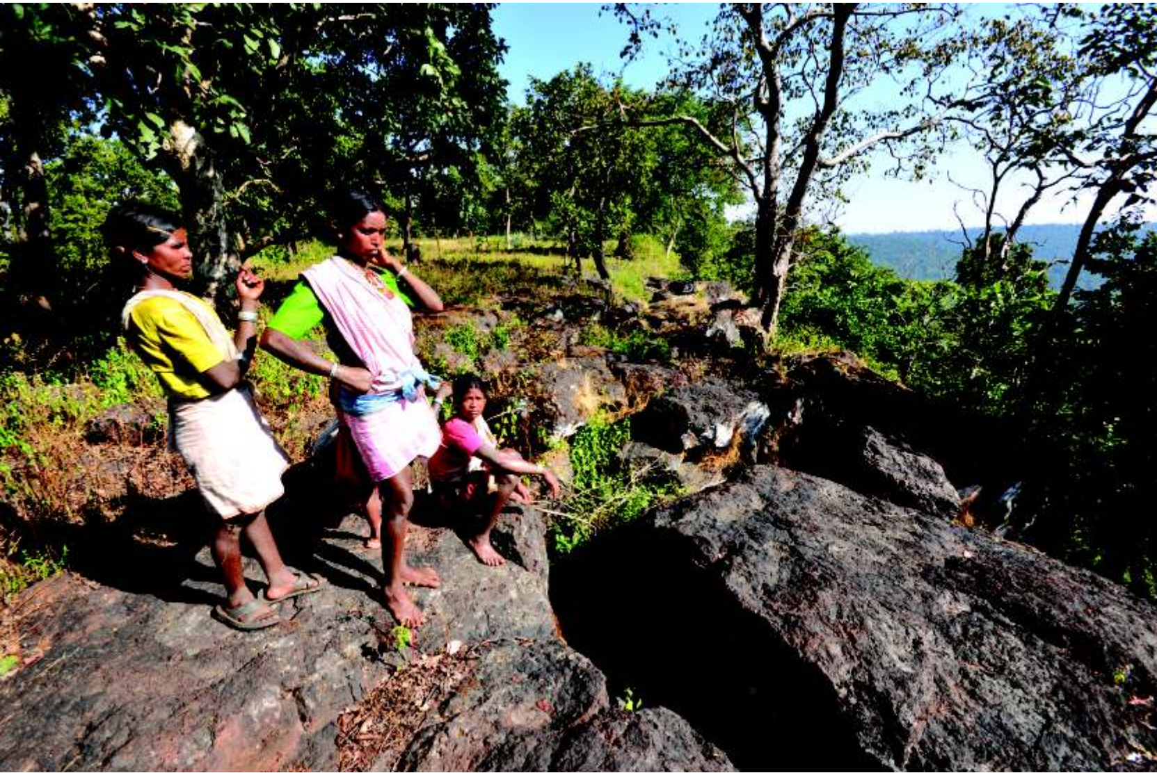
Figure 8 Baiga women of village Pondi, Dindori (Ashish Kothari)