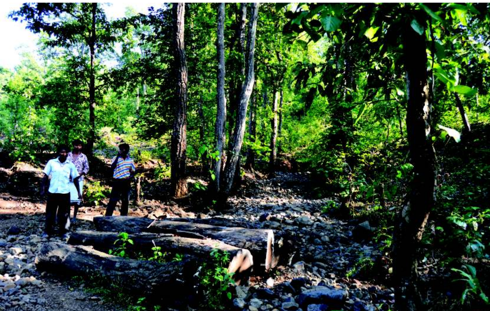
Figure 4 There is local opposition to coupe felling in many villages of Baiga chak region, Dindori district, Madhya Pradesh (Ashish Kothari)

Conflicts between the Forest Department and the forest dependent communities have intensified in some areas of continued operation of FD plans in areas where CFRs have been recognized or are in process of being claimed. Examples are coupe felling operations in Dindori district of Madhya Pradesh, bamboo cutting by Central Pulp Mills in Sagbara tehsil in Narmada district and in the Dangs in Gujarat, paper mill operations in Kandhamal in Odisha and Vidarbha region of Maharashtra, and timber harvesting in