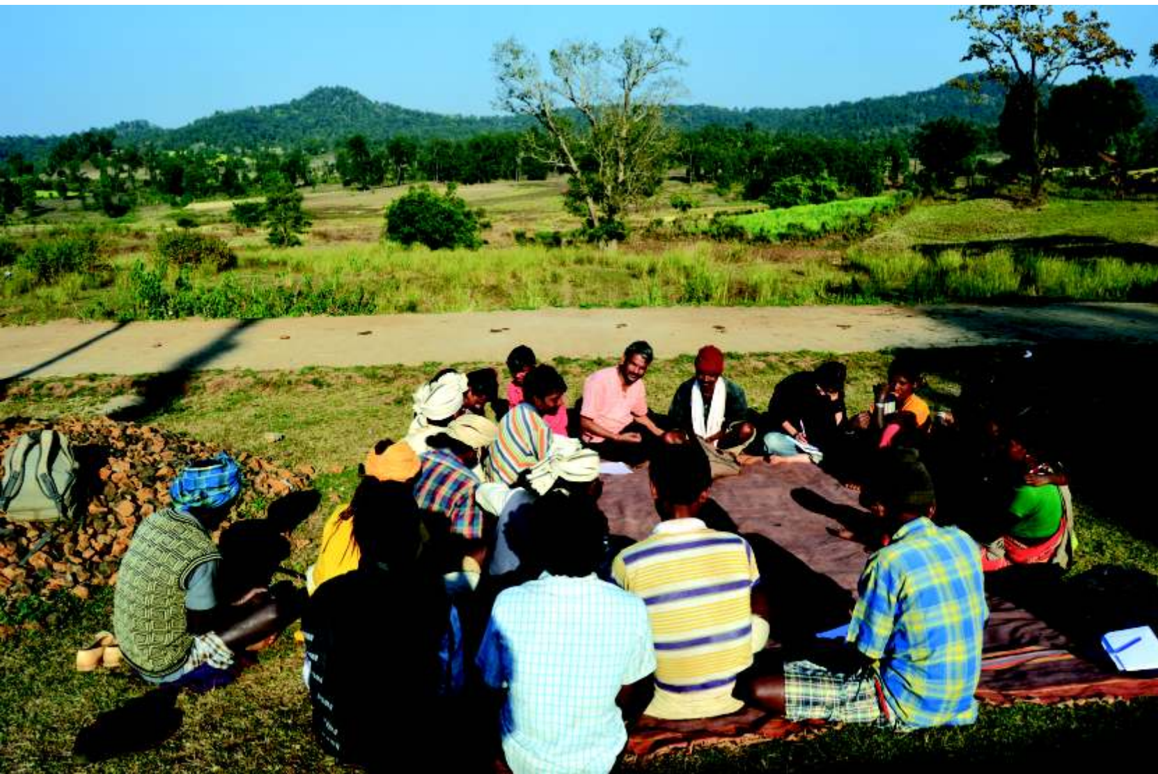
Figure 9 A discussion on the post-recognition scenario of forest governance in the village of Ranjara (Dindori district, Madhya Pradesh) (Ashish Kothari)

the FRA was promulgated. Portions of forests in Dhaba have been closed to grazing for more than three years. Villagers claim that the forest protection activities and stoppage of coupe felling has led to greater availability of water in the streams near the village as well as regeneration of char , tendu , fuelwood, medicinal plants, tubers, mushrooms and fodder. Similarly, in Pondi, villagers claim that forest protection has caused the streams in the surrounding Kasai Kund area of forest to become perennial in their flow again.