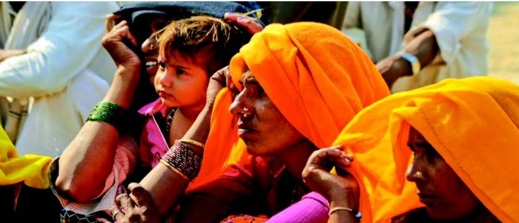
Figure 15 Villagers of Umri (present in core of Sariska Tiger Reserve) who have been relocated to Maujpur Roonth, in a discussion on problems being faced after relocation