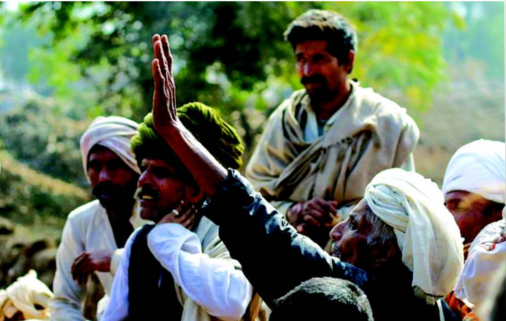
Figure 16 A discussion on community forest rights and relocation in village Kraska of Sariska Tiger Reserve in Rajasthan (Vinay Nair)

This section presents a summary analysis of key issues being faced in implementation of the CFR provision because of legal, institutional and other problems. The discussion on issues is followed by a list of recommendations for consideration by the implementing agencies. This section draws on the lessons from national review and the conducted case studies (annexed), as well as discussions which have taken place during the CFRLA Consultations and on the CFRLA list-serve. It is also based on lessons shared in the MoEF-MoTA Committee report of 2010.