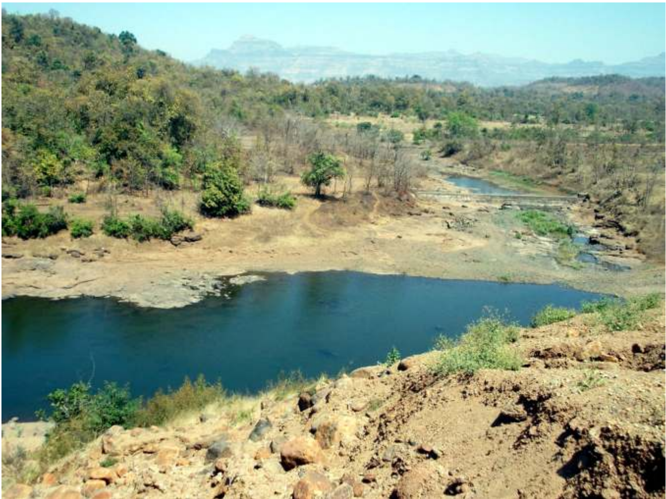
Figure 13 The site of construction for the Kalu drinking water project on river Kalu, near Thane district, Maharashtra (Shiba Desor)

there has been no further processing. Government has not conducted any awareness activities about CFRs. The revenue and tribal department officials are unaware of amended rules. Officials have not recognized oral and circumstantial evidence for CFR. The forests in many parts of this district have been degraded and the local community has little belief in possibility of regeneration of forests. SMS has also helped file 25 CFR claims in Murbad Taluka which were also given to Tehsildar to be passed forward. The filing of CFR claims gained momentum due to the Kalu dam coming up in the area which people are strongly opposing, SMS is going to file an RTI to understand the status of the claims.